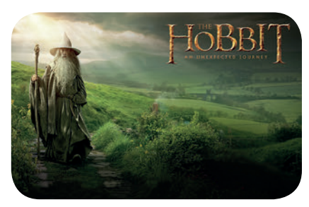
adventure / fantasy