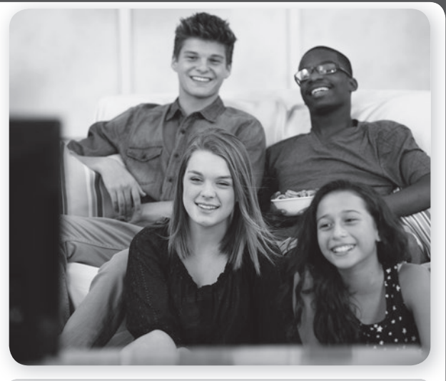
(8) Do / Does you like cartoons or game shows?

Yes, I <sup>(9)</sup> do like / do . I always watch Neighbours . <sup>(10)</sup> Its / It's an Australian soap opera about some people who live on Ramsay Street. The singer Kylie Minogue was a star on this programme.